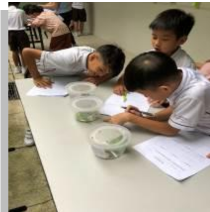
Observing the caterpillars at the Butterfly enclosure

It was indeed heartening to observe the participants' excited and smiling faces as they explored the great outdoors.