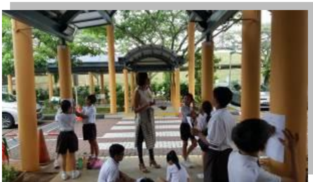
Searching for checkpoints