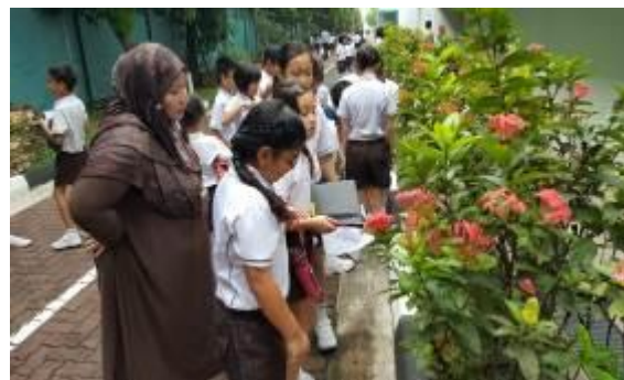
Learning about plants through AR technology