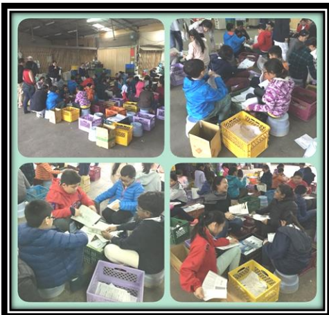
Helping out at the Tzu Chi Recycling and Educational Centre