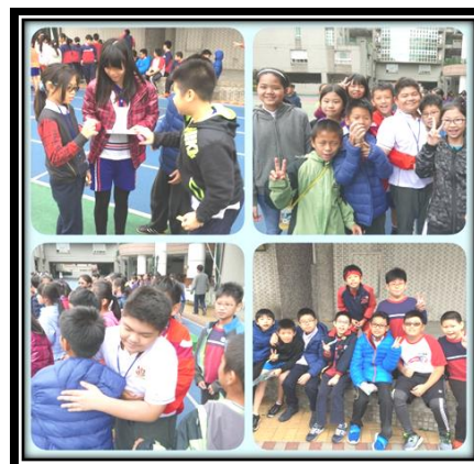
Bidding farewell to buddies on the last day of the school experience