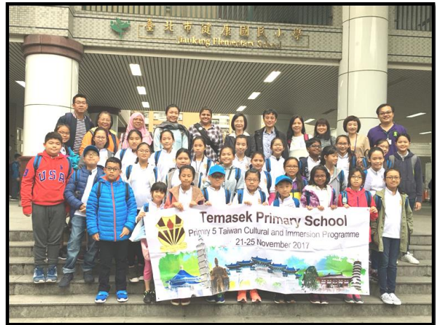
With the principal and staff of Jian Kang Elementary School