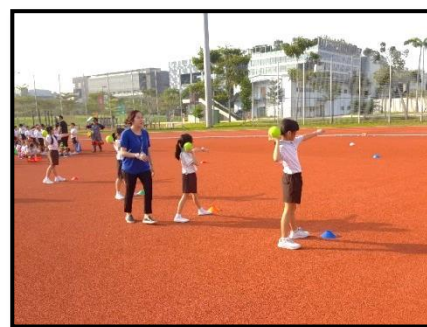
P3 pupils attempting the shot putt @ Track & Field Carnival held at SUTD