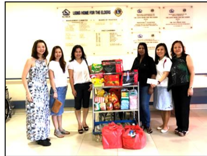
PCC members at the Lions Home with food items for the old folks.