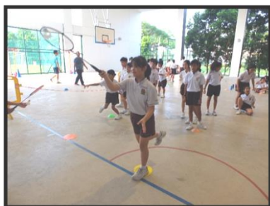
Pupils putting their skills to the test @ Sports Fiesta