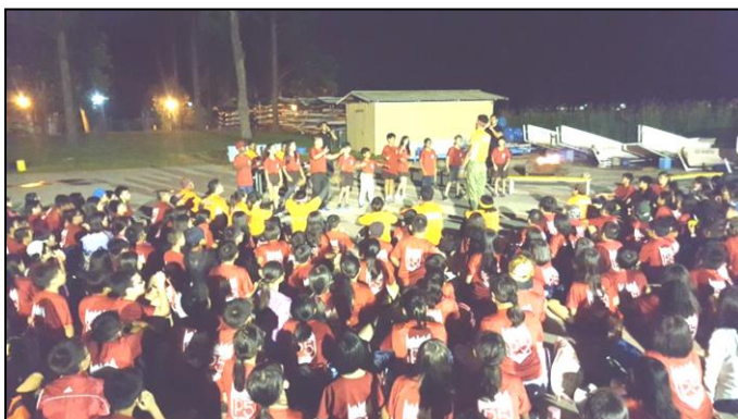
Performances during the campfire

During the campfire, all the classes gave impressive performances with their dance, songs and cheers. We are very proud of our P5 pupils for demonstrating the values and habits learnt in school during the camp.