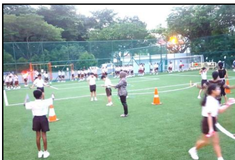
Teachers and pupils skipping together