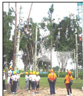
Challenge rope course