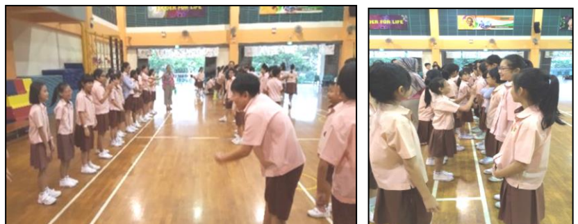
Students affirming one another

For the P6 pupils, the teachers used the Circle Time Structure to provide the opportunity for pupils’ voices to be heard. Some pupils took this time to affirm their peers who made a positive change in practising respect after their last PSP session.