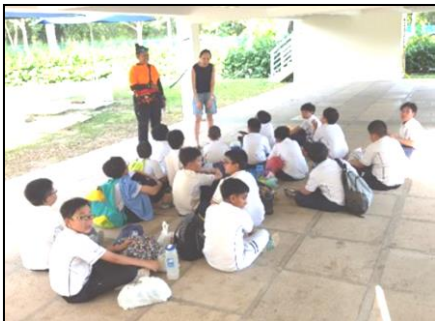
Reflecting on camp activities

The school conducted the Primary 5 Adventure Camp at MOE Changi Coast Adventure Learning Centre from 13 to 15 February 2017, in collaboration with Trexx Pte Ltd. Over the course of three days, a total of 220 P5 pupils stepped out of their comfort zone and challenged themselves through a series of outdoor activities such as zip line, abseil, rock climbing and a challenge rope course. Throughout the camp, the teachers had the opportunity to strengthen the bond between themselves and their pupils.