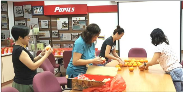
PCC members packing mandarin oranges for distribution to the school community and residents from the Lions Home.

The PCC members embarked on a CIP activity this year. In the spirit of bringing cheer to the residents from the Lions Home, the PCC members made a personal donation – the money raised from the sale of the gold plated orchids. The orchid, named Dendrobium Temasek Parent Volunteers, was named after the PCC and Parent Volunteers. Besides monetary contributions, the PCC also presented food items to the residents of the Lions Home.