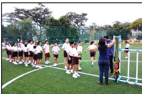
Lining up to collect the skipping ropes