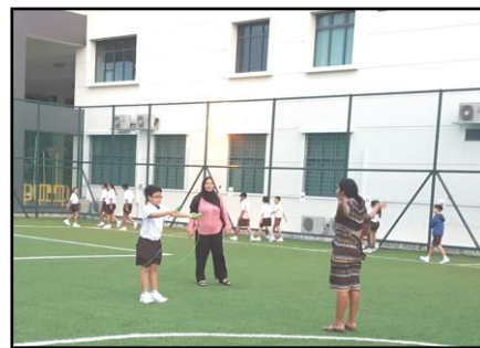
Personal coaching by our teachers

As a school, Temasekians achieved a whopping 87 091 skips during this period. The final tally and the top male and female skippers for each level were as follows: