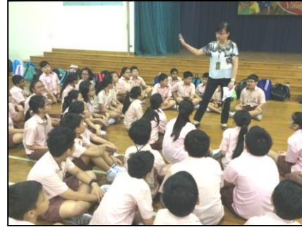
Learning about a new precept