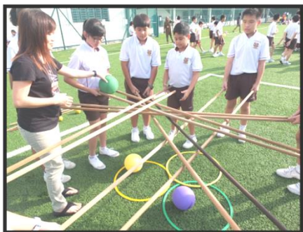
P6 teachers and pupils working together @ Character through Play

The PE department started the SOAR programme on 6 March 2017 with the aim of getting pupils to enjoy sports and physical activities, regardless of their ability. The P3, P5 and P6 pupils were involved in either the Track and Field Carnival, Character through Play or Sports Fiesta.