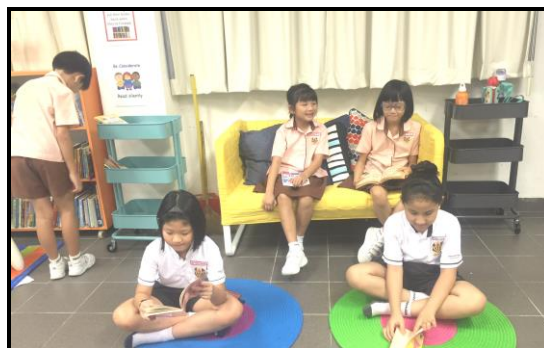
Cosy reading corners