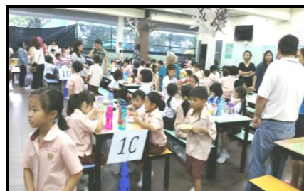
Primary One pupils interacting with their Primary Two peer leaders